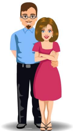
uncle - aunt