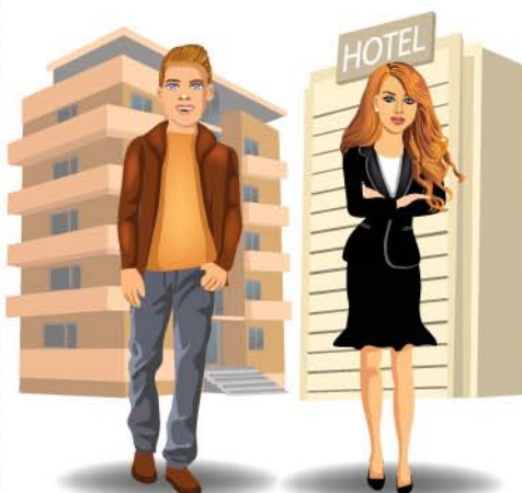
heir - heiress