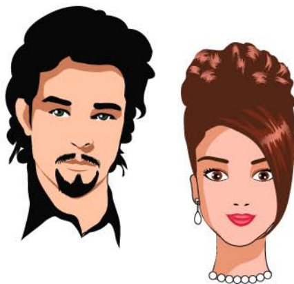
gentleman - lady