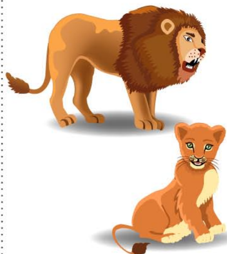
lion - lioness