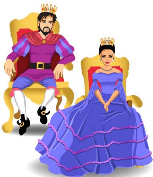
emperor - empress