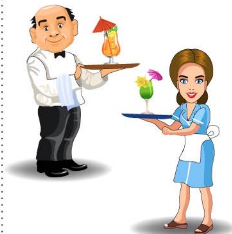
waiter - waitress