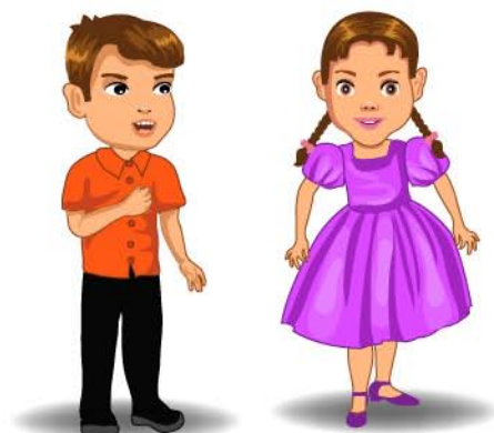
nephew - niece